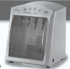
Lubrina™ Handpiece Maintenance System

** NSK and Phatelus are registered trademarks of NAKANISHI INC. Name of coupling varies by country.