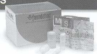
Foundation™ Collagen-Based Bone Filling Augmentation Material

(Foundation is available in both small and medium sized bullets. Box of Small contains 10 units, box of Medium contains 5 units, and the Assortment Pack contains 3 each of small and medium units.)