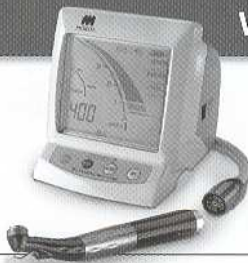
Root ZX® II Apex Locator with Optional Low Speed Handpiece

Purchase a Root ZX II Apex Locator, receive a $50 (USD) rebate. Purchase a Low Speed Handpiece Module, receive an additional $50 (USD) rebate.