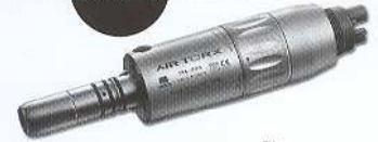
Air Torx™ Low Speed Air Motor